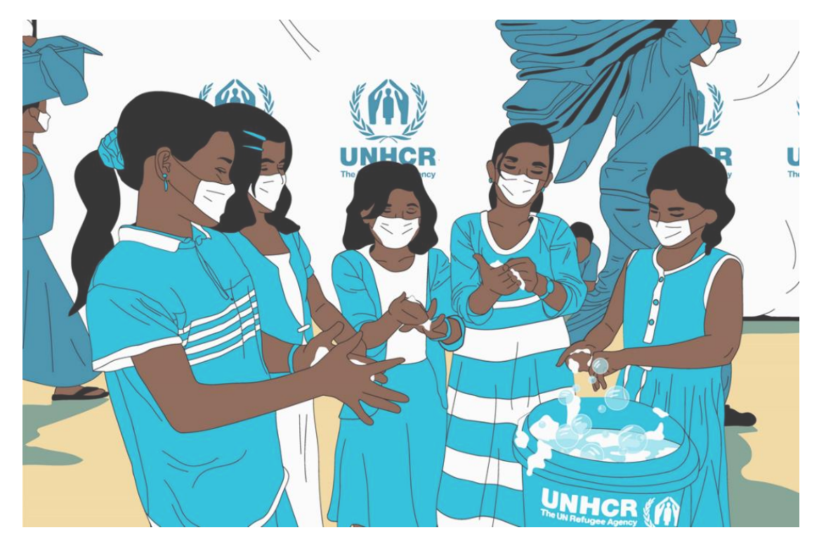
Geórgia, 18, Brazil, UNHCR 2020 Youth With Refugees Art Contest

Examples of UNHCR gender responsive and gender-based violence (GBV) prevention, risk mitigation and response interventions